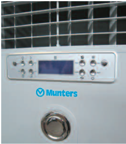
Close up of the display with different running features.